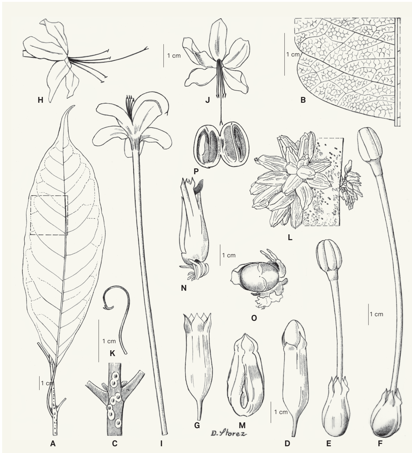
Fig. 1. – Line drawings of Clerodendrum kamhyoae Phillipson & Allorge. A. Leaf showing long attenuate-acuminate apex and arcuate secondary veins; B. Detail of secondary and tertiary leaf venation; C. Stem node showing lenticelles; D. Early flower bud with the corolla pushing open the sepals; E. Young flower bud with elongating corolla tube; F. Pre-anthesis flower bud; G. Mature calyx; H. Corolla seen from side (tube incomplete); I. Corolla seen from below; J. Corolla seen from front; K. Stamen with mobile anther thecae; L. Young inflorescences; M. Calyx surrounding an immature drupe showing an irregular split due to the expansion of the ovary; N. Part of infructescence, with calyx enveloping immature fruit and pedicels of fallen flowers visible; O. Fruit with calyx removed to show the upper surface of the drupe; P. Longitudinal section of the ovary showing the two locules. [A-K: Allorge 2839, P; L-P: redrawn from photographs] [Drawings: D. Storez]